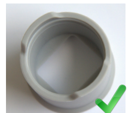
NEW TIP Internal aspect and external gray and matte