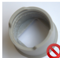
DAMAGED TIP Internal aspect and/or external shiny and sticky

LIFETIME VERIFIED FOR 100 AUTOCLAVE CYCLE PASSES.